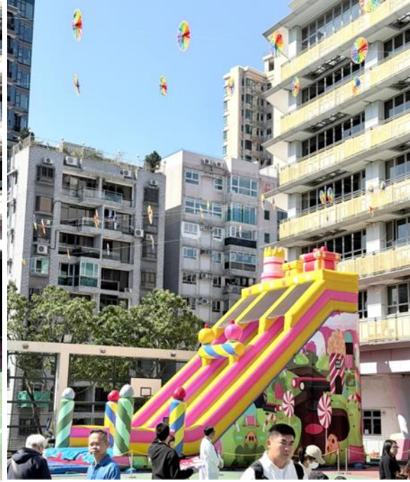
This 2-storeys high inflated slide, the tallest in HK, is great fun even for adults