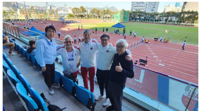
Supporters from North America