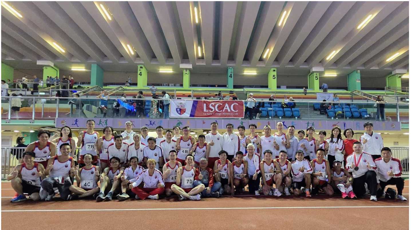
LSCAC team at Wan Chai Sports Ground