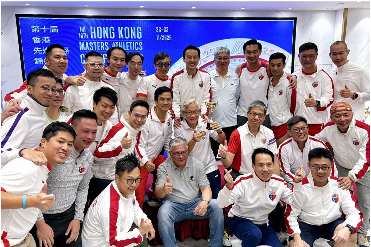
The team won the 3rd place overall trophy