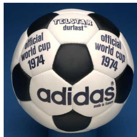
The last of the heavy sucker