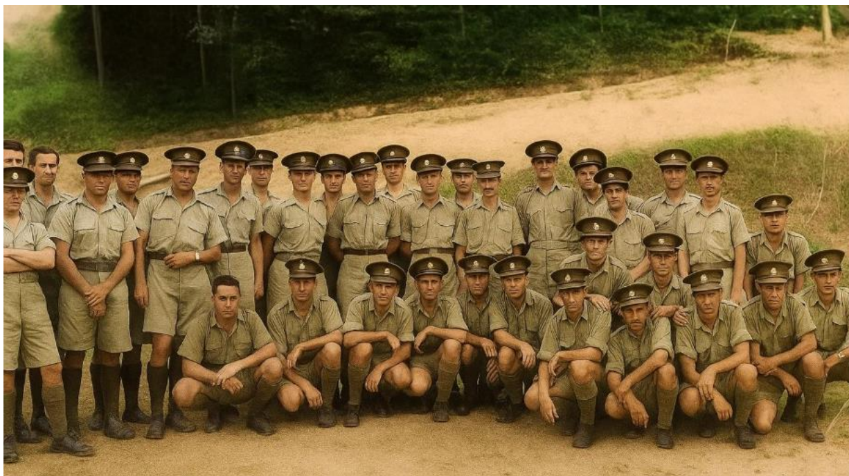
AI Enhanced Photo of the HK Volunteers Defense Corps (HKVDC), Number 3 (Eurasian) Company, which consisted of many Lasallians. They were positioned to defend Wong Nai Chung Gap.