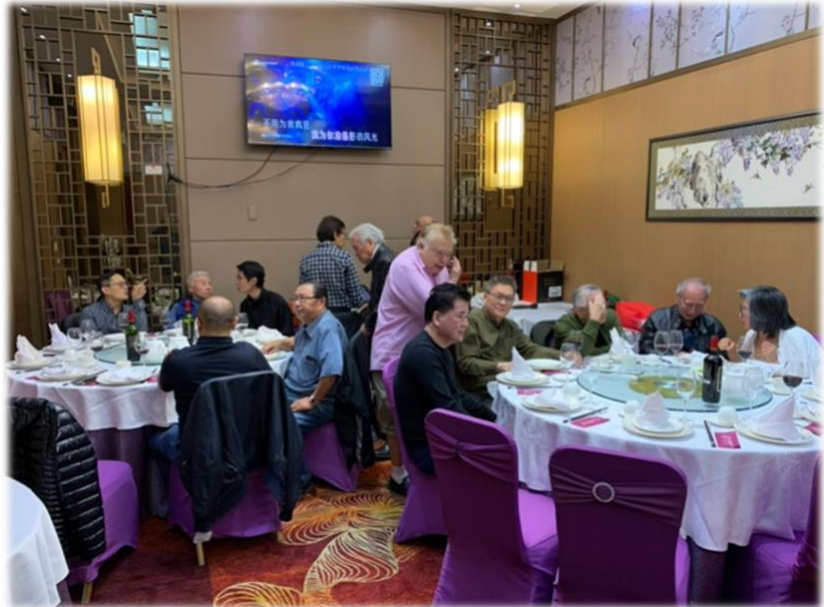
Left – Singing performance from our new President; Right – Group photo 2