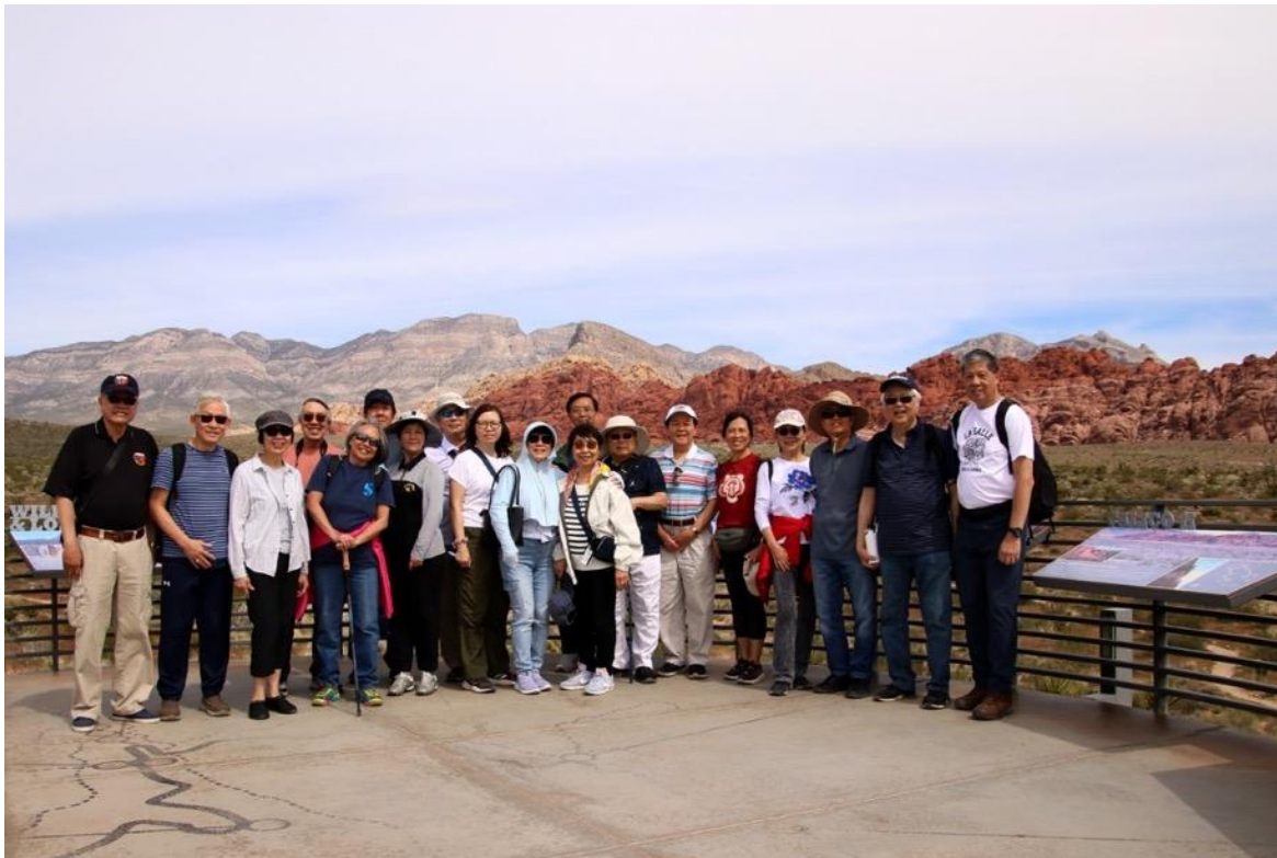
Red Rock National Conservation Area