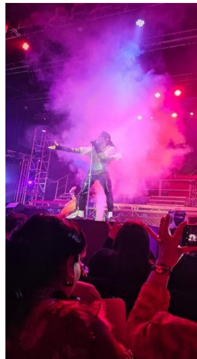
The very loud Michael Jackson Live show