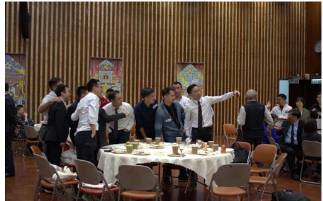
母校是個大家庭 不少同學多年來 在母校不同崗位大有貢獻