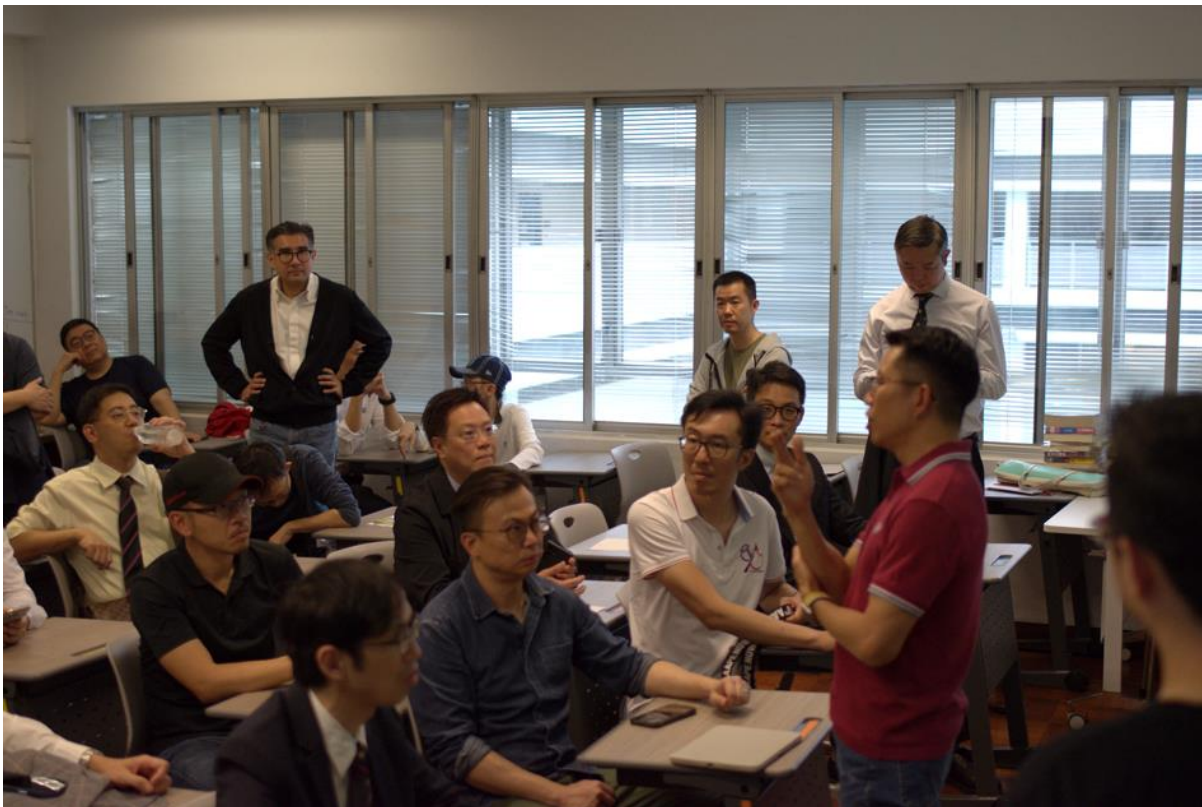
唔坐吓當年嘅班房 點算 homecoming 呢？

正副校長和舊生會向我們介紹許多新設施，而這些新設施都是不同屆別舊生們對母校的支持。