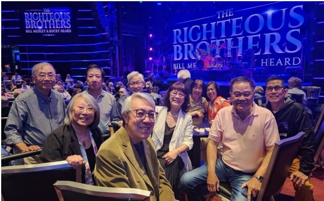
Enjoying the Righteous Brothers show