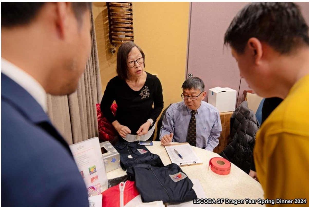
Our reception opened at 6pm in a cozy yet private room of the restaurant.