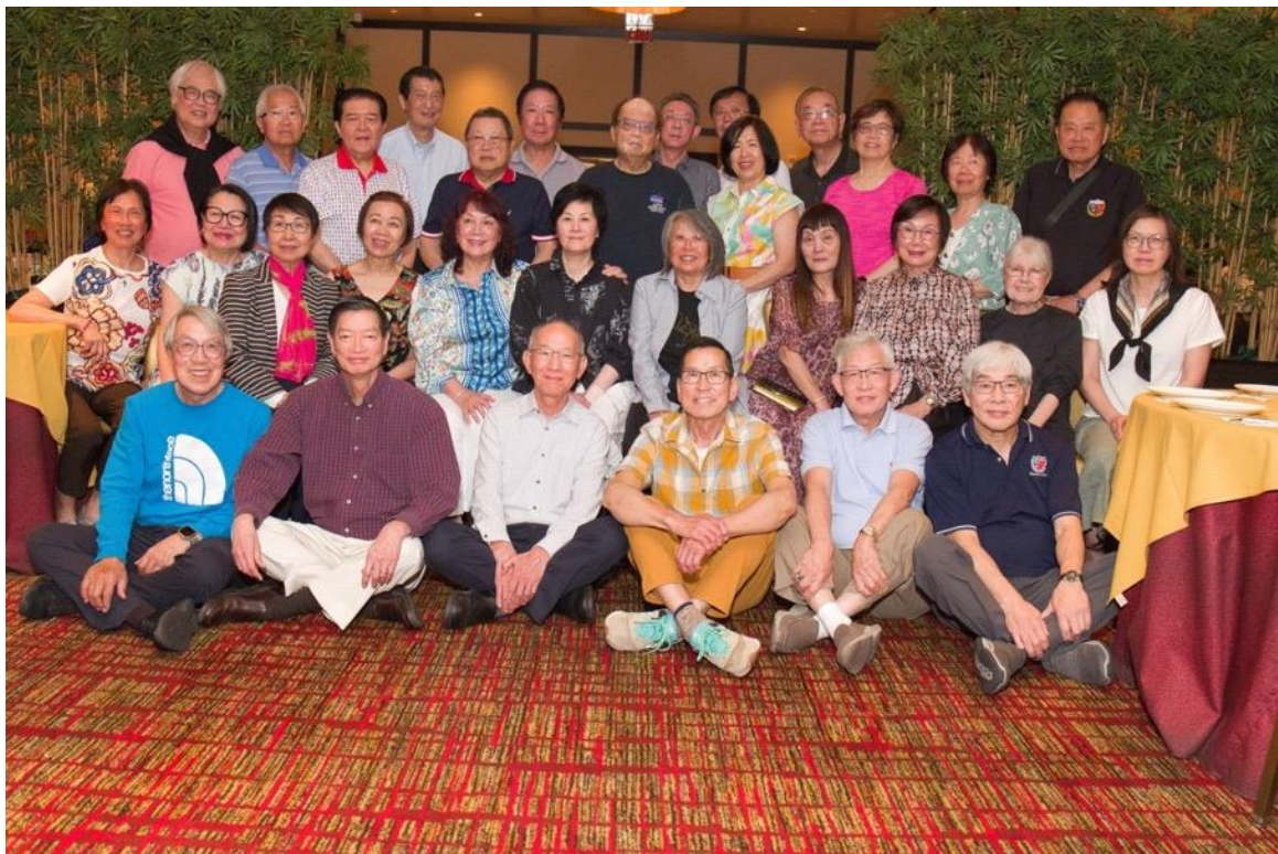
Class of 1966 old boys, spouses and girlfriends