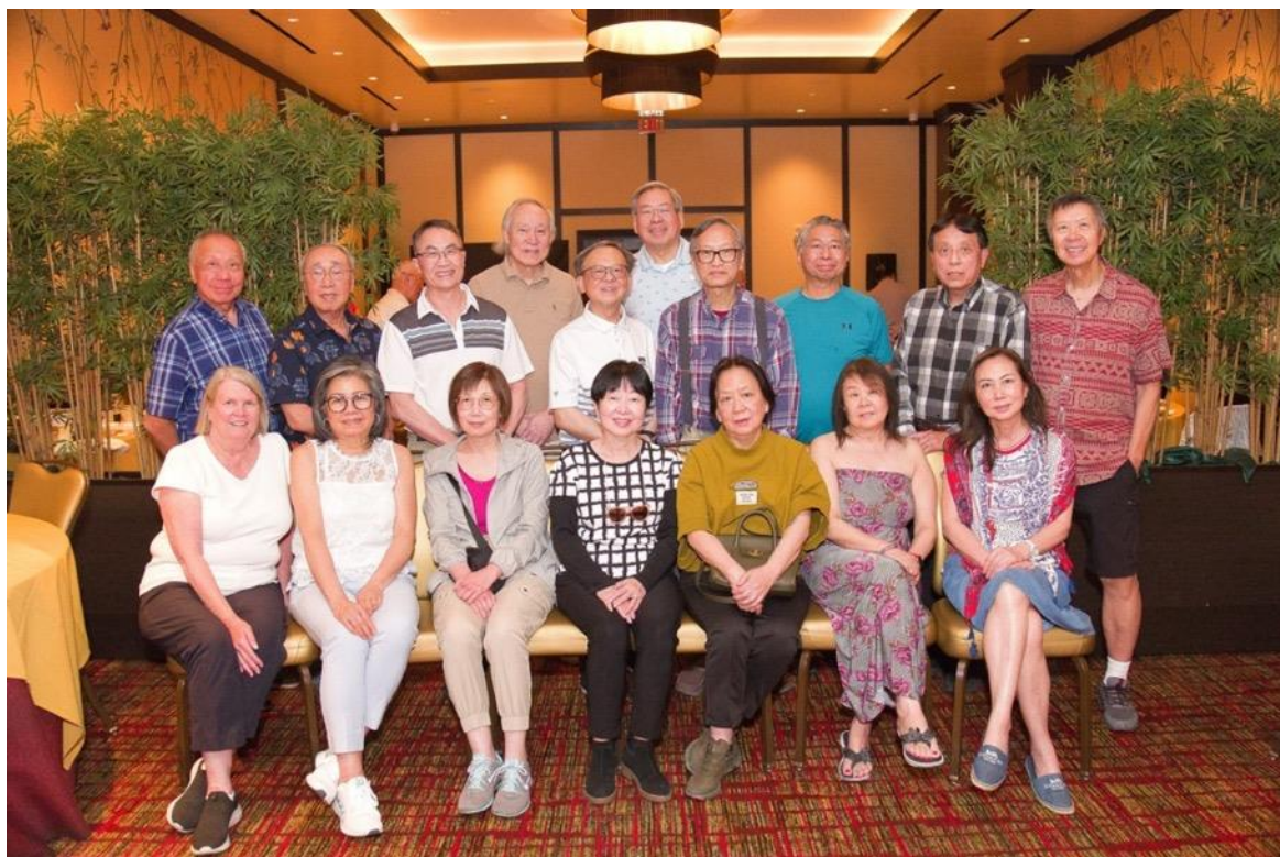
Mostly Class of 1969, 1970 old boys and spouses