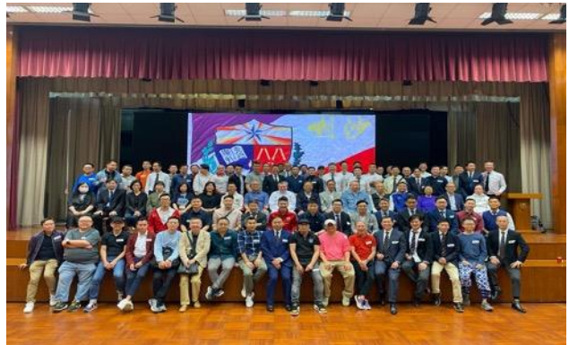
數不盡的班主任合照和 club/group reunions