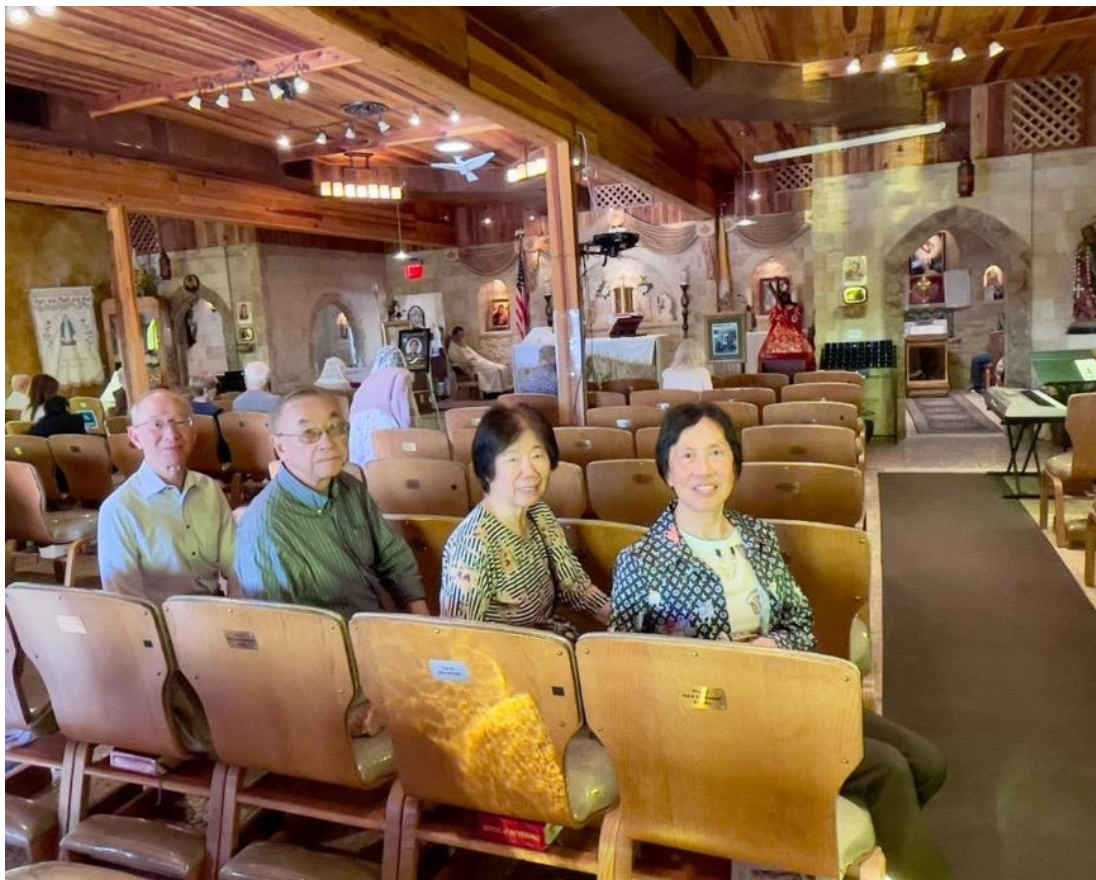
Not forgetting to visit a local church