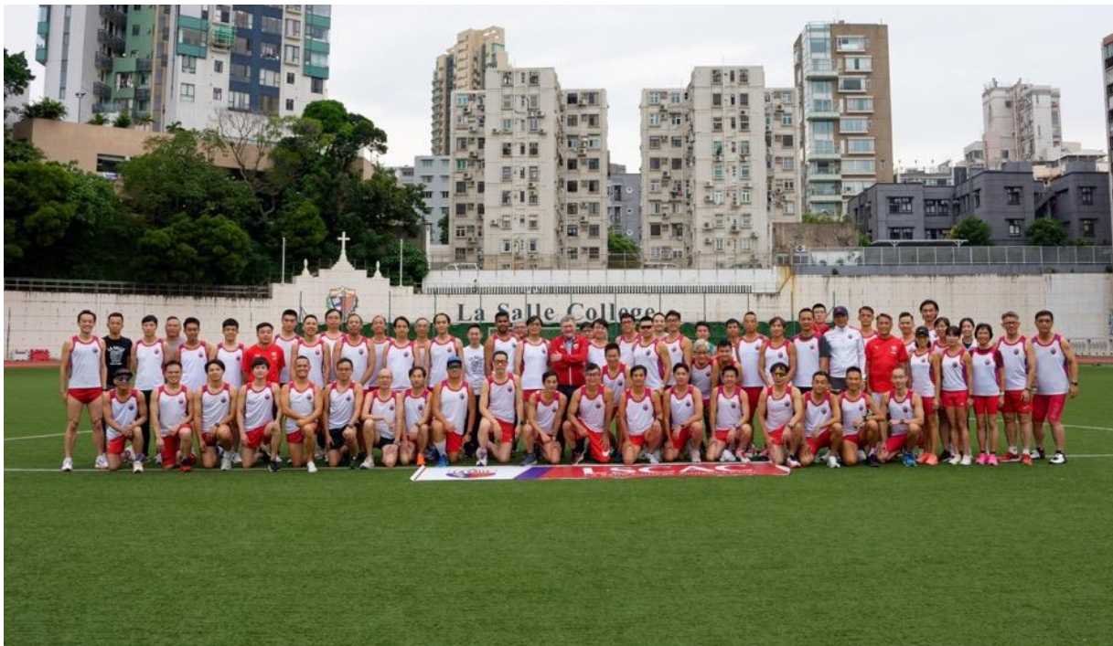
2023 年 10 月 21 日 La Salle College Athletics Club 誓師大會