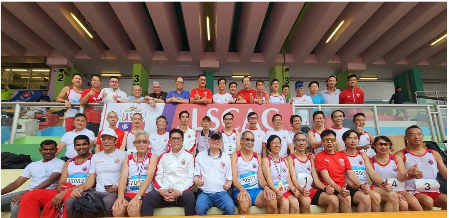
LSCAC master athletics meet, Oct 27 – 29th, 2023