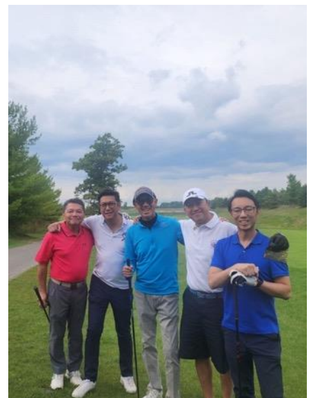
Brother Thomas Cup golf tournament at Wyndance Golf Club