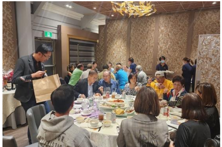
Award ceremony at Venue Starchiva Cuisine