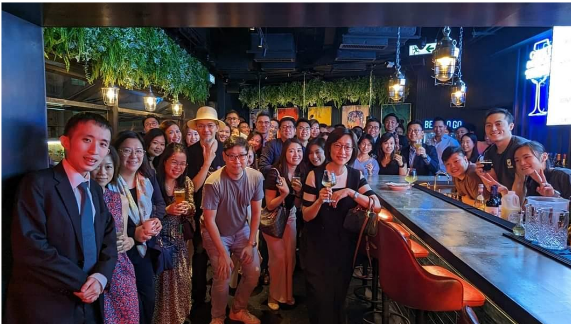
Happy Halloween Hour BrewDog Hong Kong by: La Salle College Old Boys' Association Maryknoll Convent School Former Students' Association Heep Yunn School 協恩中學