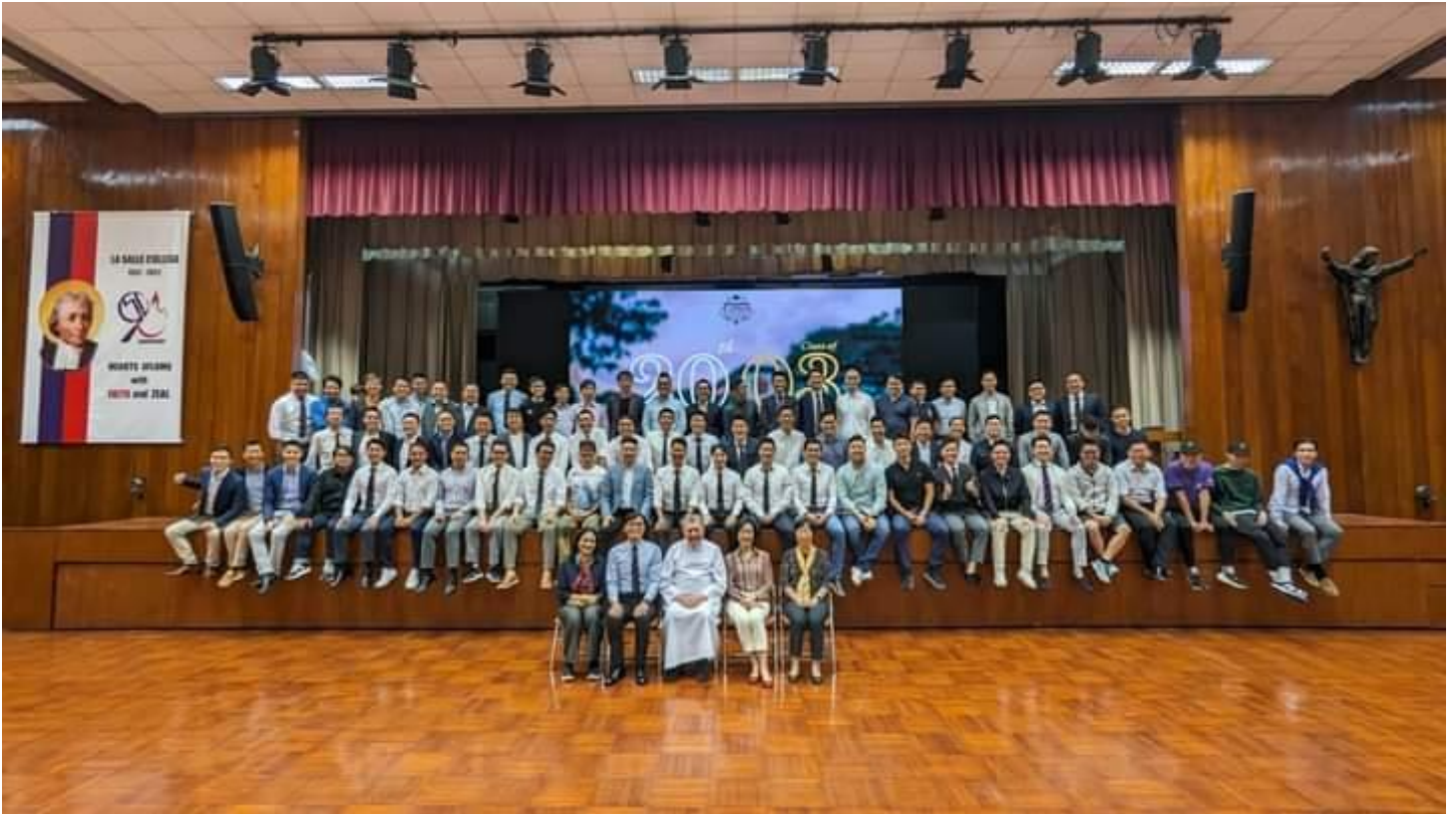
Class of 2003 anniversary reunion