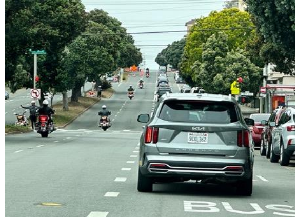
Police Guarding the Route