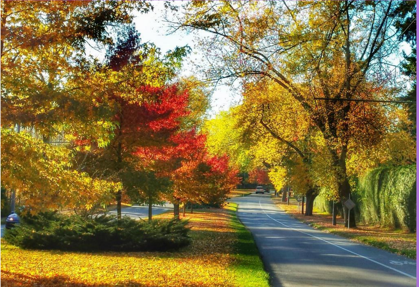
10 th Ave, Vancouver BC - one of the main entrances to UBC showcasing its spectacular Fall Foliage to visitors.