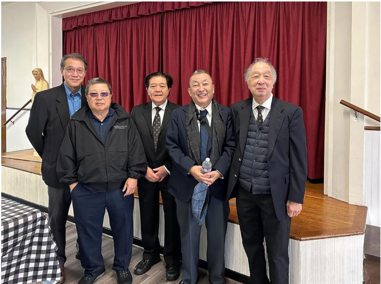
A group of SF 66er