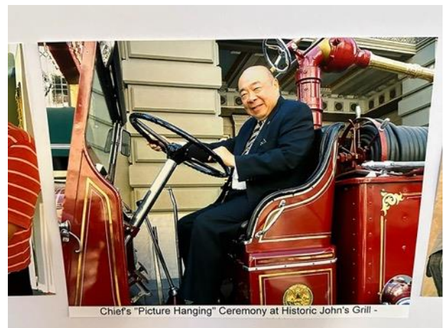
Chief's "Picture Hanging" Ceremony at Historic John's Grill -