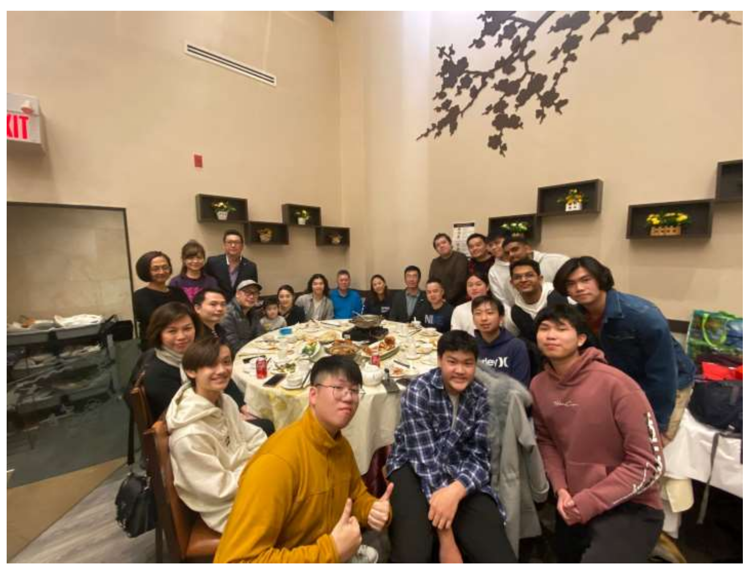
We were honored to host a big group of young old boys who called Toronto their new home over the last few years.