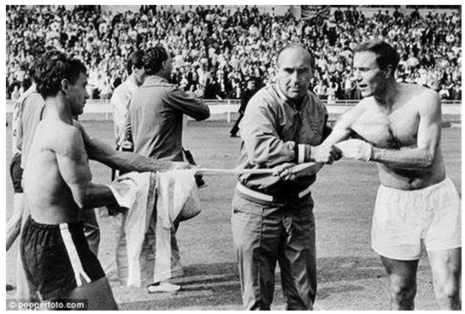
Ramsey stopped the jersey exchange

• Ramsey's team talk prior to extra time in the final: "You've won it once. Now you'll have to go out there and win it again" and the team made it happened.