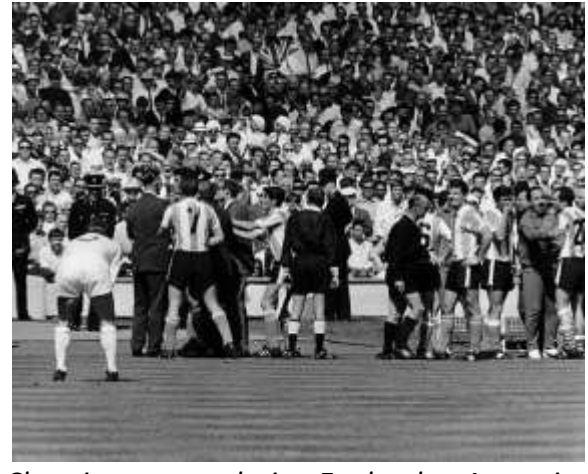
Chaotic moment during England vs Argentina

England lost to Yugoslavia by 1-0 in the semi final through a late goal but beat the Soviet Union 2-0 for 3rd place in the 1968 European Nation Cup. With an even better defense than 1966, the team lost to W. Germany in a heartbreaking quarter final in the 1970 World Cup after conceding a 2 goal lead with a 3-2 lost in overtime. There goes a truly golden generation in England football as they would miss out the next 4 major tournaments before appearing in the 1980 European Nation Cup again.