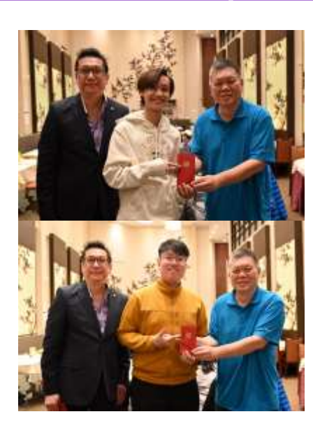
LSOBA branded lai see envelopes are crowd pleasers.