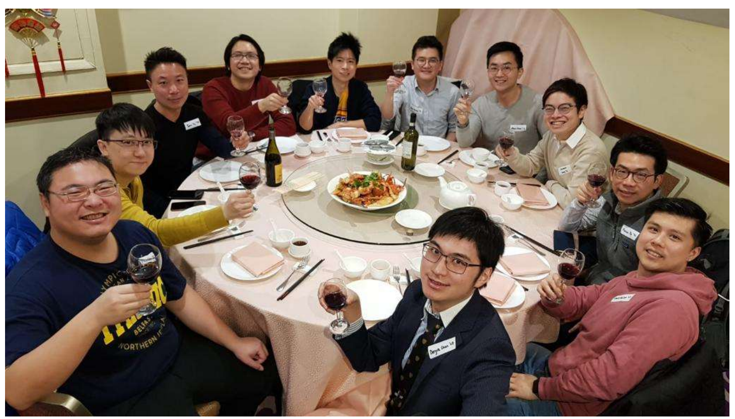
"The UK Chapter wants to wish everyone well and world peace in these unprecedented times. The world is changing fast, the UK La Salle old boys feel proud to continue our long-established tradition to gather and demonstrate our spirit no matter where we go. We will concert our effort to make the UK Chapter grow stronger in the years to come."