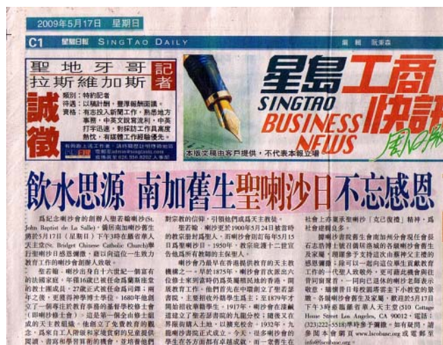
Clip from Sing Tao Daily

After three months of planning, discussions at two Board meetings, a month of choir practice, several times of email broadcasts, weeks of calling Old Boys to spread the word and a rehearsal, LSCOA Southern California Chapter inaugurated its first LSDTM on the afternoon of Sunday, May 17, 2009. The objective was threefold: to celebrate the Feast Day of St. John Baptist de La Salle (founder of the Brothers of the Christian Schools), to pay tribute to our Brothers and teachers, and to foster friendship among Old Boys and their families.