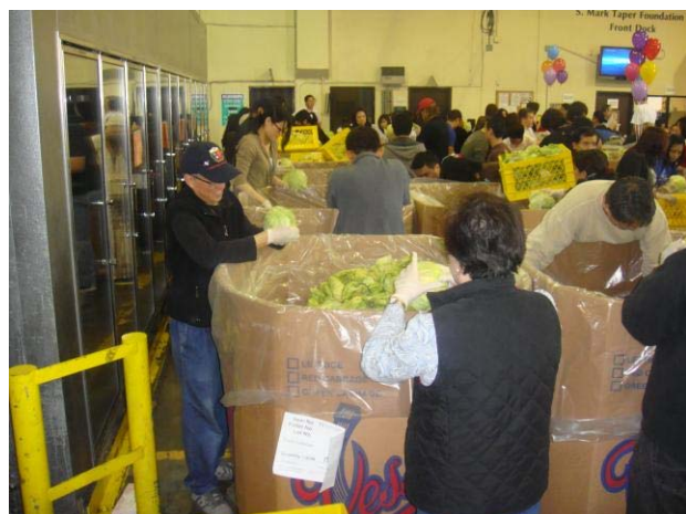
Old Boys at work

On April 25, 2009, 15 old boys and loved ones gathered at Los Angeles Regional Food Bank to help assembling food packages for the Commodity Supplemental Food Program. Our jobs were preparing and packing raw cabbages for transportation to their local food centers. Some of us put the cabbages into plastic crates after peeling off the bad leaves, while some others stacked up the loaded plastic crates for delivery. After a morning of volunteering work, the group enjoyed a dim sum lunch at the Empress Harbor Seafood Restaurant in Monterey Park. More pictures can be found at http://www.lscobasc.org/gallery/ .