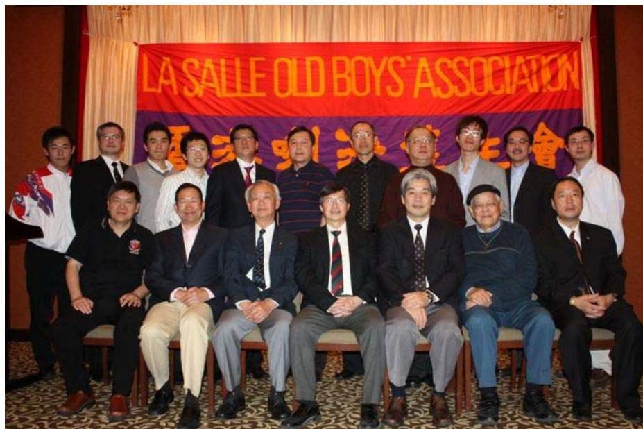
Toronto Chapter Board of Directors 2009- 2011