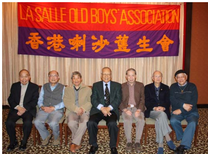
Old boys from the 40's

With the new Board spanning across more than 40 years, we hope we will be able to tailor our chapter activities to stimulate renewed interest from more old boys.