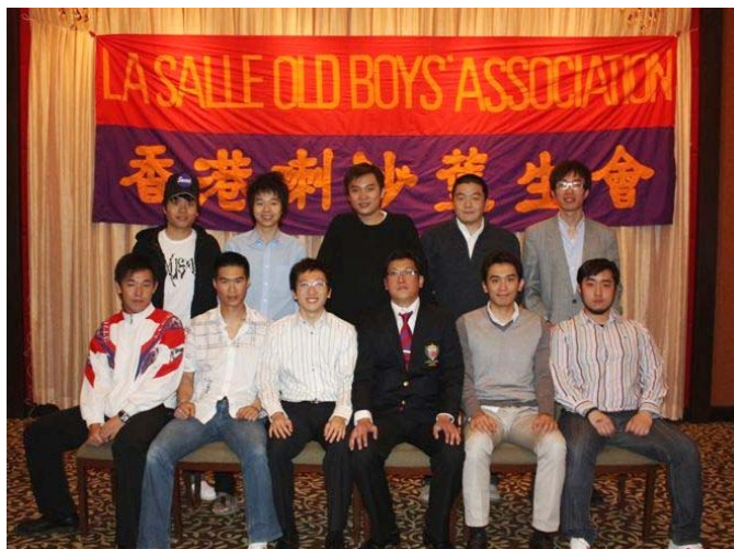
Old boys from the 1990's and 2000's