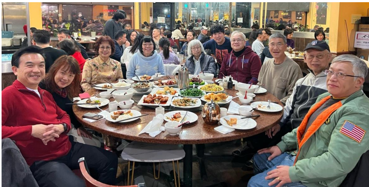
Dinner gathering in Rockville, Maryland

So good seeing so many familiar faces at the alumni Chinese New Year dinner! Always such a treat catching up with good friends who go way back! For those who couldn't make it (and anyone else who might be around next time!), hope to catch you later!