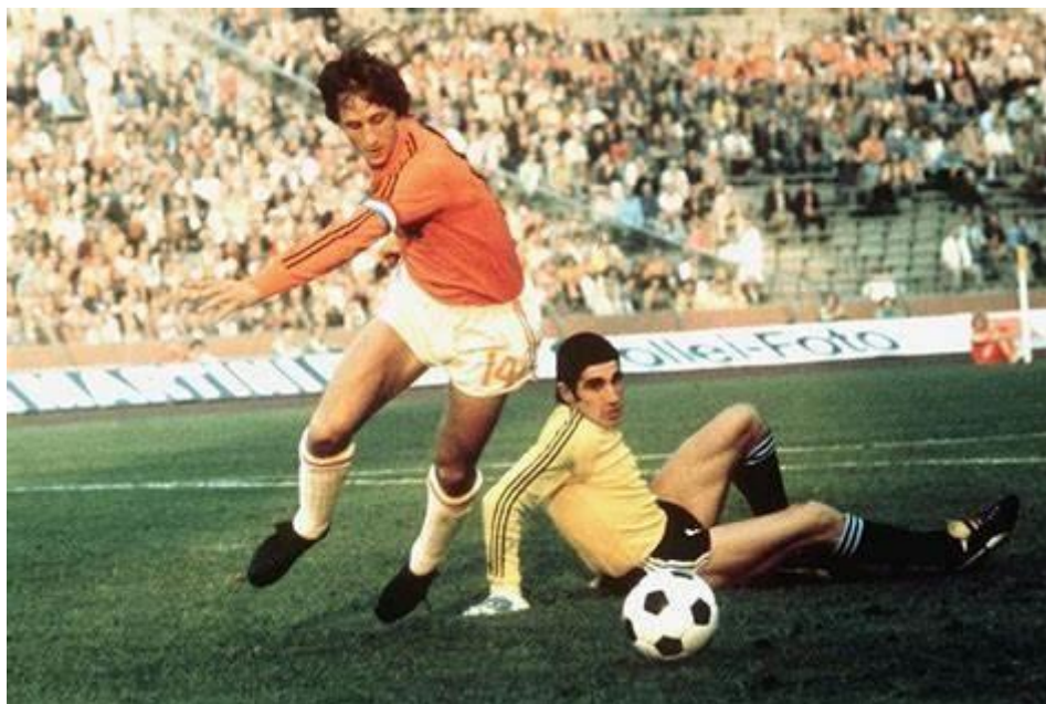
Cruyff danced around the Argentina keeper

Uruguay 2-0, Sweden 0-0, E. Germany 0-1, Bulgaria 4-0, Argentina 4-0, E. Germany 2-0, Brazil 2-0, W. Germany 1-2.