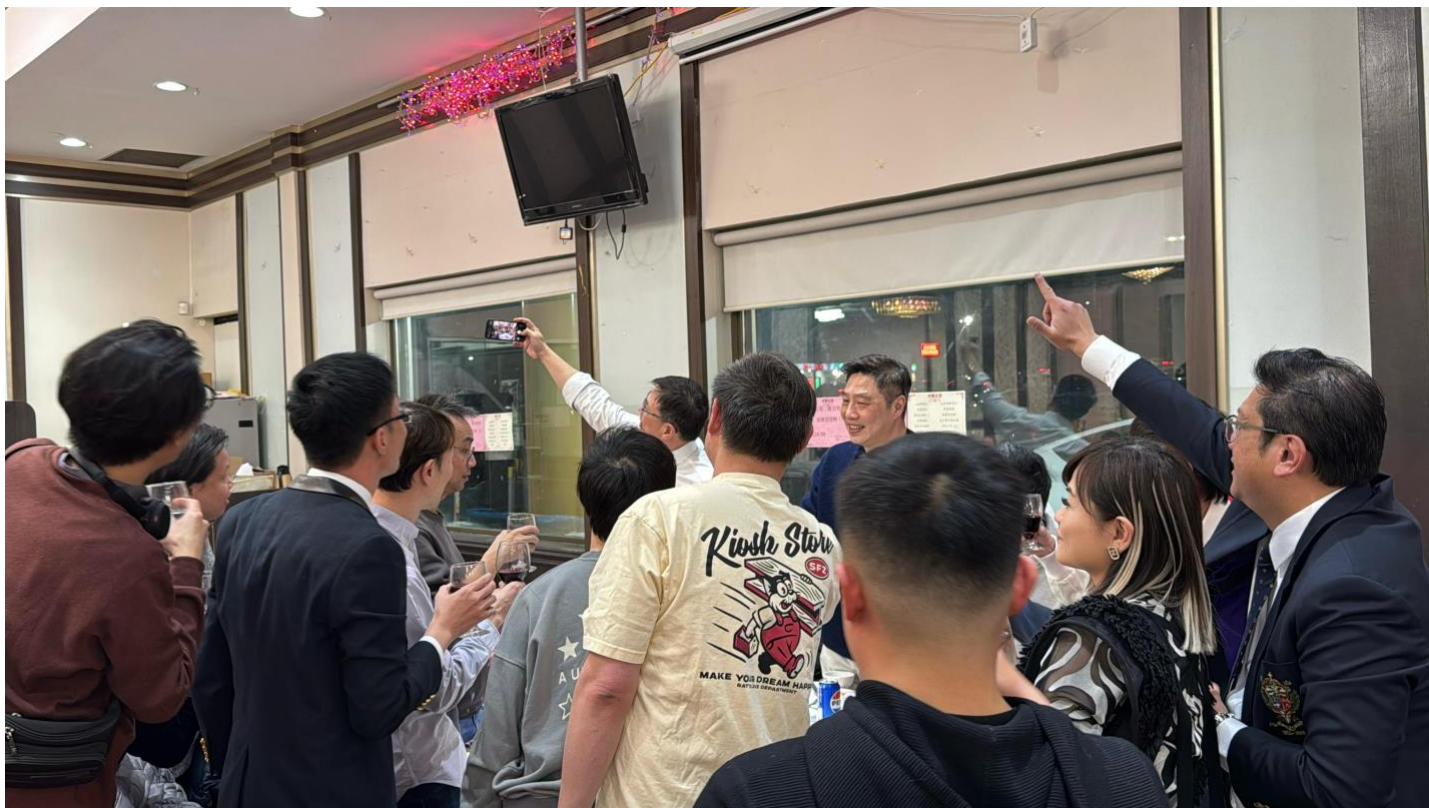
Cheers and selfies