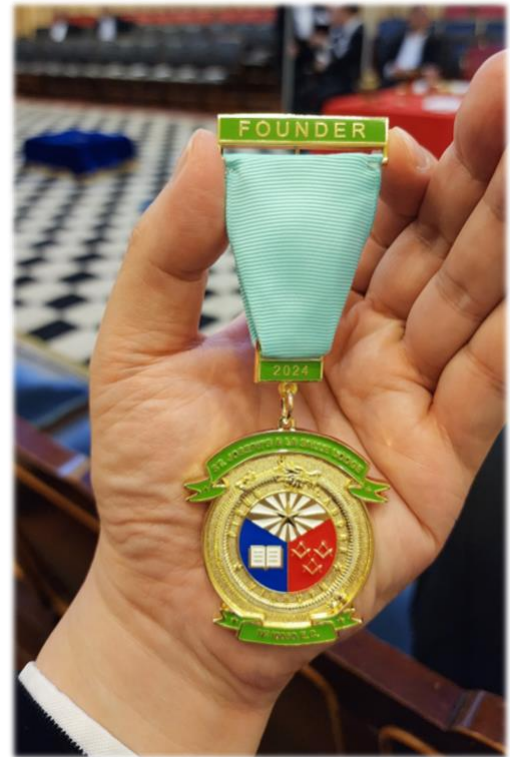
The Founder's Jewel of the newly Consecrated Lodge. Only founders are entitled to wear this medal.