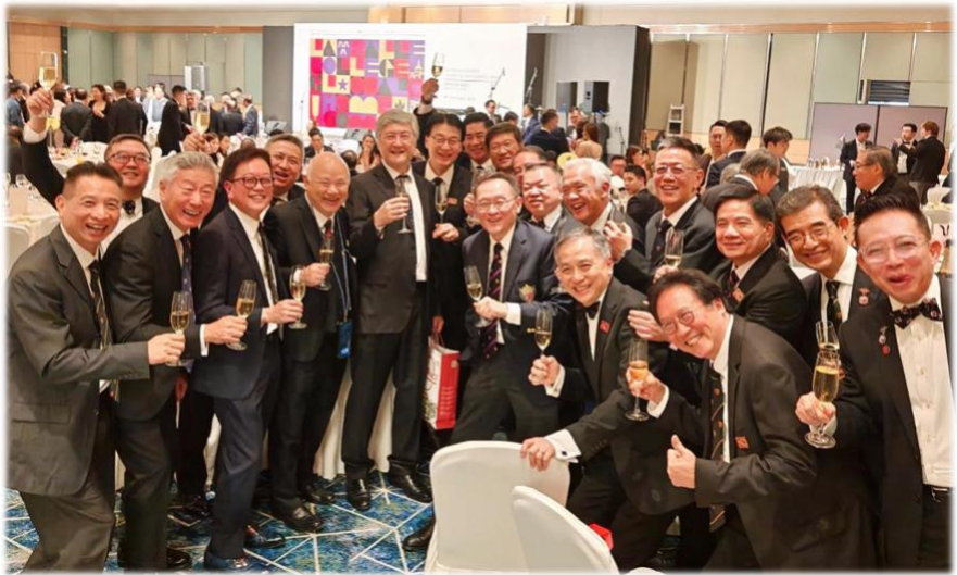
Top Right – Most Jovial Group