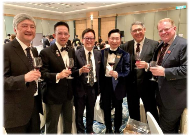
Bottom Right – Professors, Presidents and Chairmen