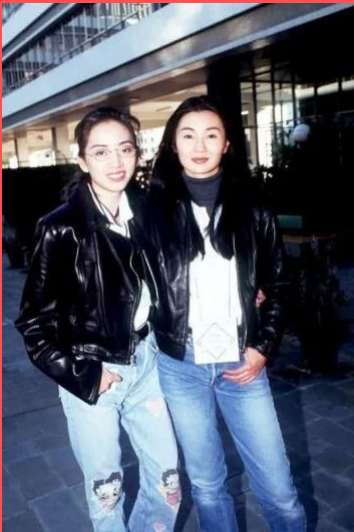
This photo was taken at La Salle Campus in the early 90s