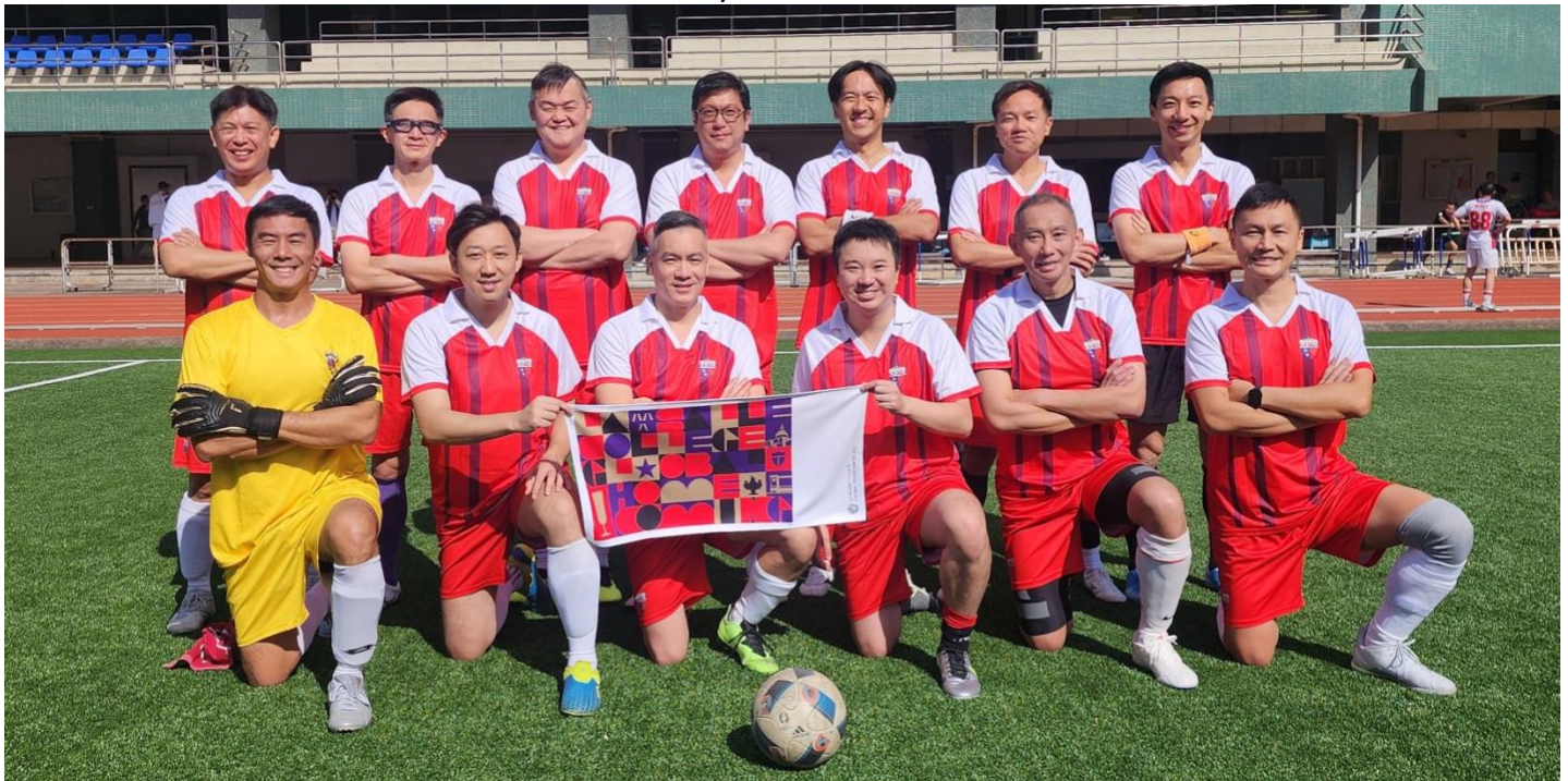
Many of these players have been overseas for quite some time