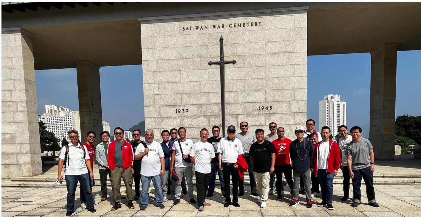
Overseas chapter executives