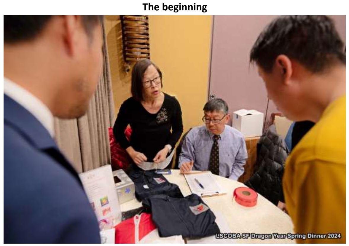
Our reception opened at 6pm in a cozy yet private room of the restaurant.