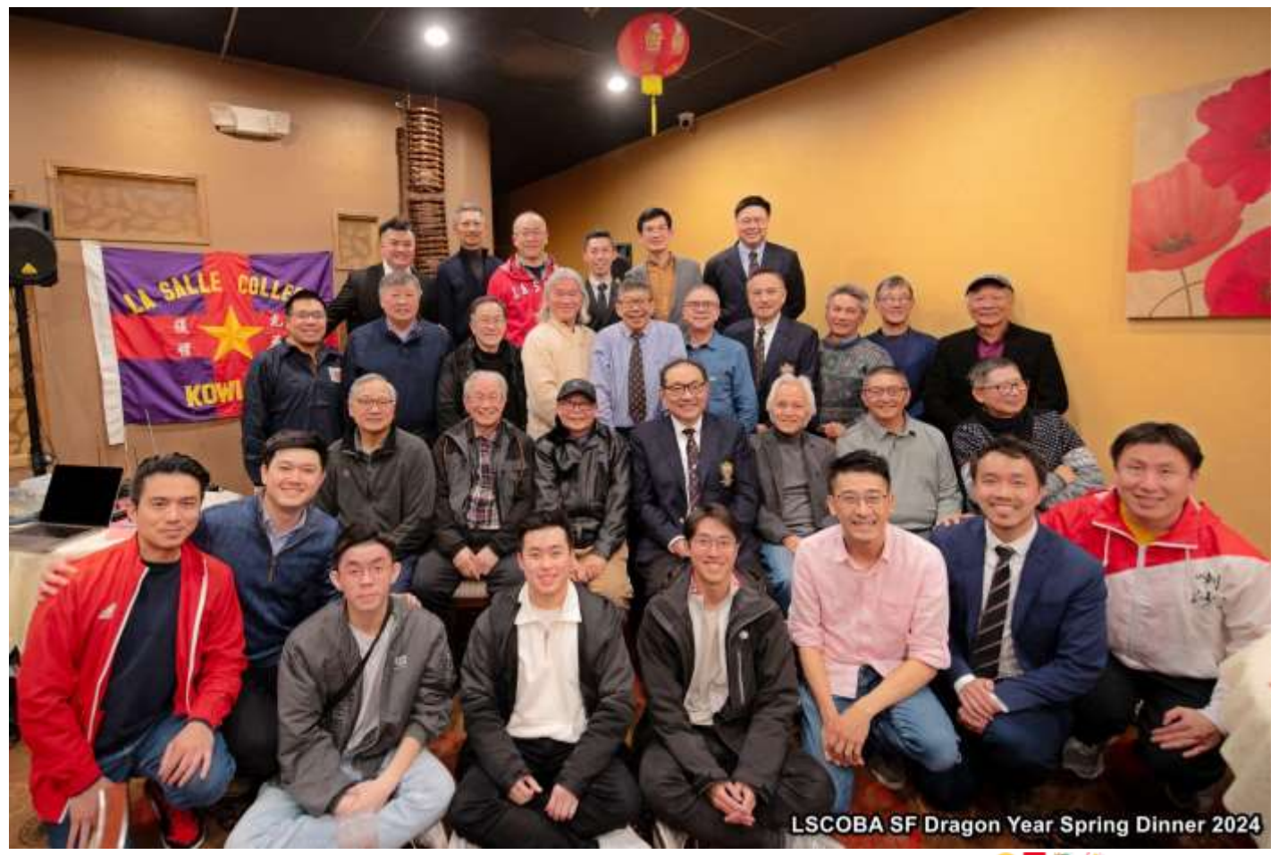
三藩市喇沙舊生會仝人祝各位龍年行大運! 萬事如意! 身體健康! 😂 🗖 🎘 🎉

This is, after 4 years, we finally got together to celebrate the Chinese New Year! This is our first spring dinner ever since the outbreak of the COVID-19.